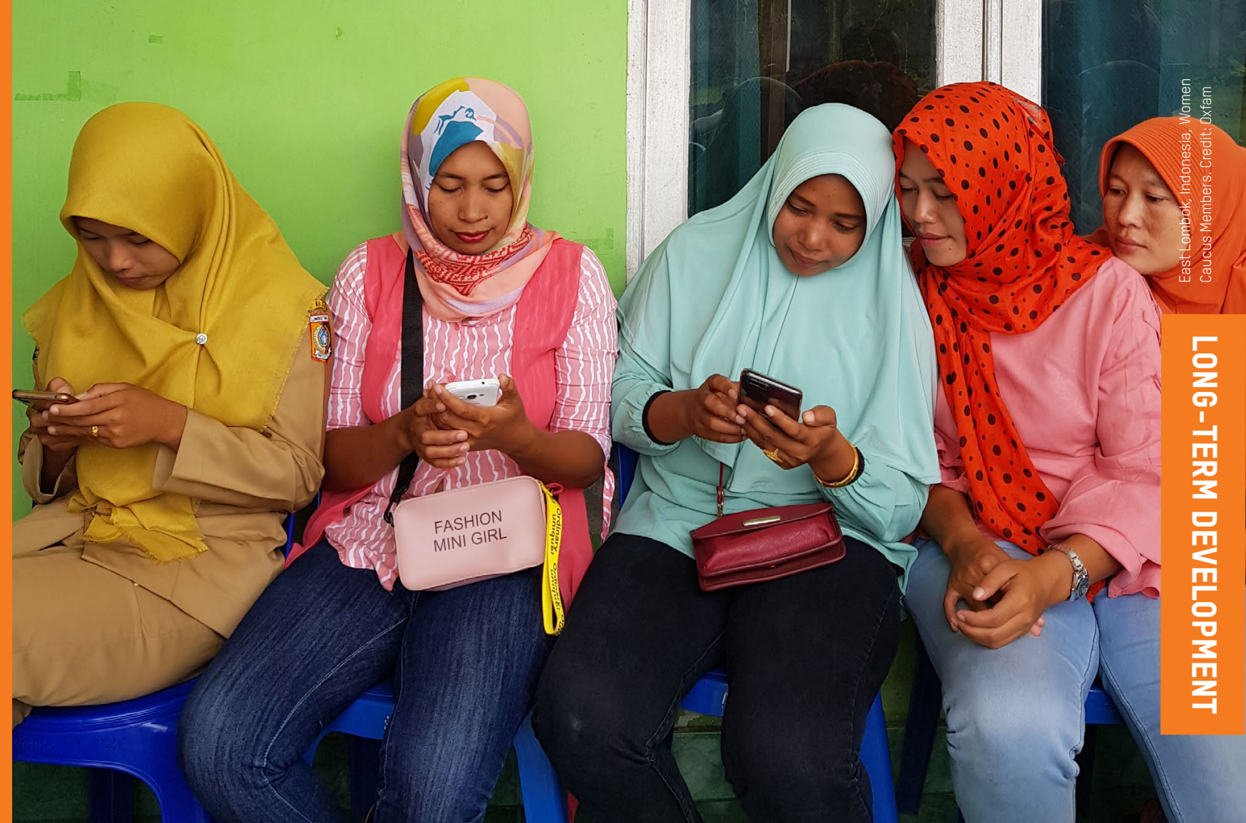
East Lombok, Indonesia, Women Caucus Members.

When women are at the table, their health, their rights and their interests are better represented!