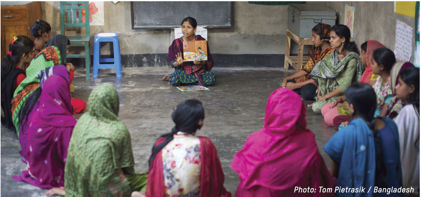
Bangladesh