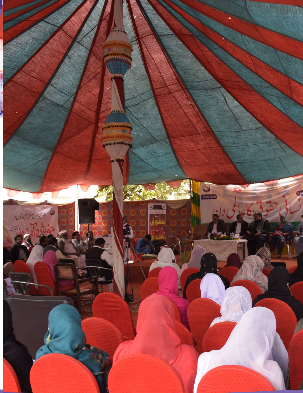
> Aurat Foundation meeting in Pakistan.