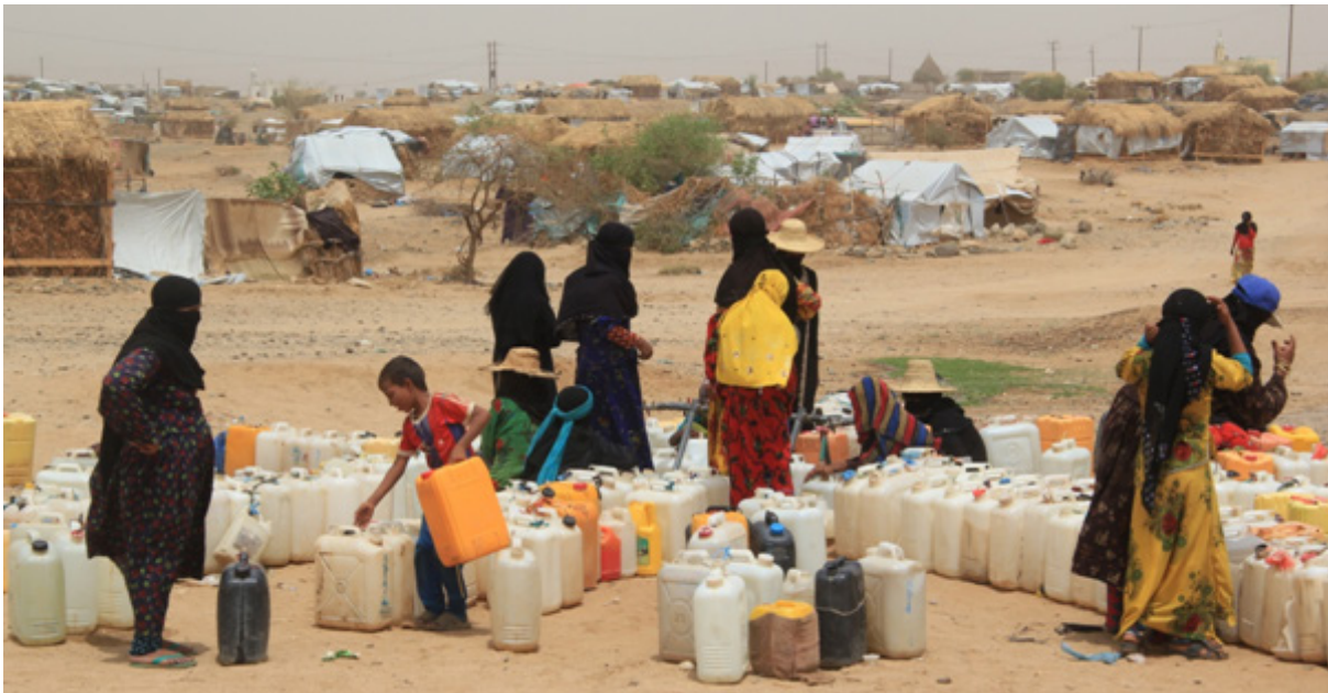
Water point in Al-Manjorah Camp, Bani Hassan, Abs district, Hajjah governorate.