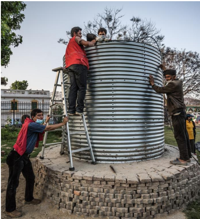
Oxfam staff and volunteers construct an 11,000 litre water tank at Tundikhel IDP camp. Oxfam is providing water to 15,000 people here.