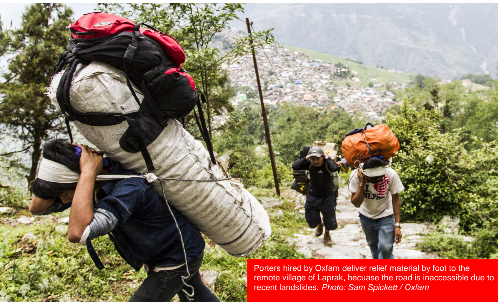
Porters hired by Oxfam deliver relief material by foot to the remote village of Laprak, because the road is inaccessible due to recent landslides.

We have also employed mountain guides and porters to help deliver supplies to even the most remote communities. Not only has this meant aid has been delivered safely and quickly, it has provided work for the guides, who have struggled to find work after the earthquake. Their knowledge and expertise has been invaluable in reaching people.