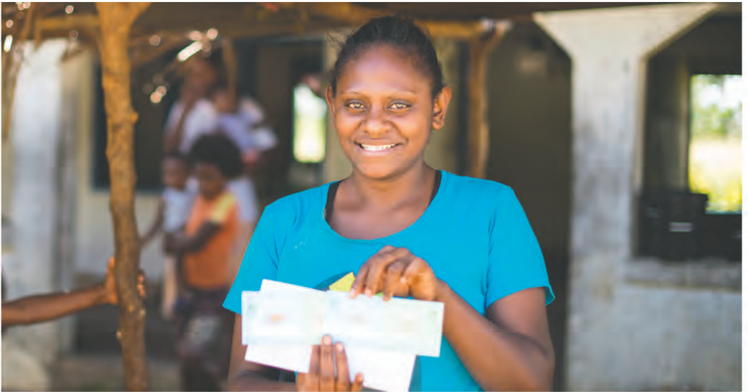
Oxfam has been distributing vouchers to families affected by Cyclone Pam. The vouchers can be exchanged at specific local stores and suppliers for items farming and building materials, and other general goods. The aim is to help them rebuild their livelihoods and grow food.