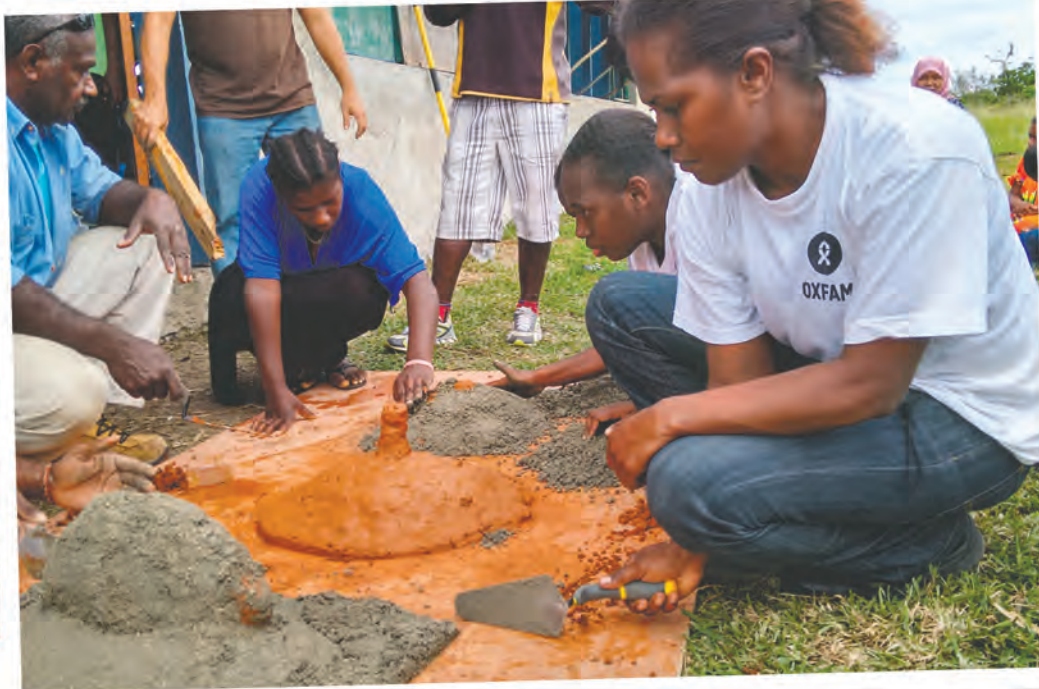
Women take part in Oxfam's plumbing training in north-east Efate.