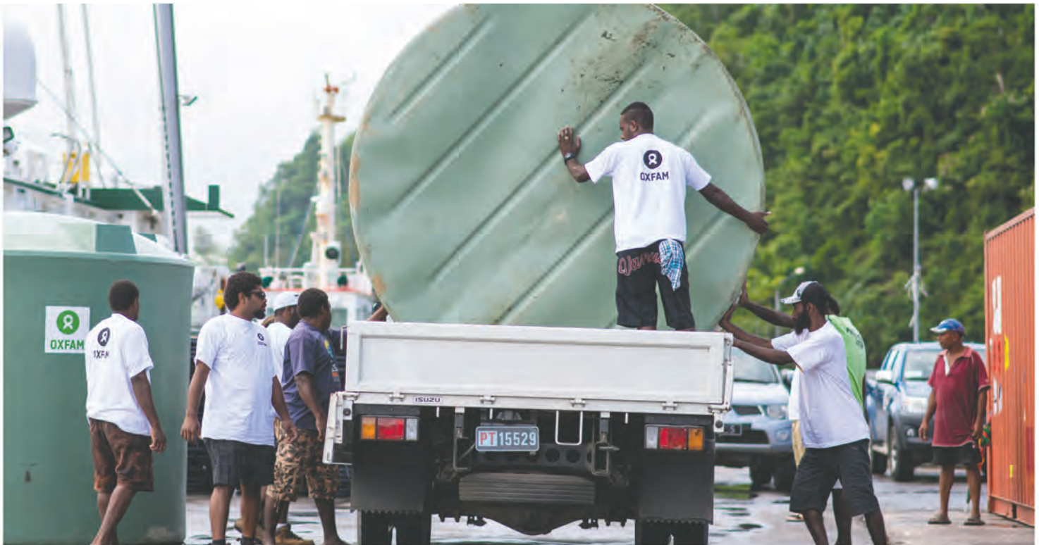
An Oxfam team unloads a water tank from a truck. Tanks were loaded onto the Greenpeace ship Rainbow Warrior to be transported to Epi Island. Oxfam has partnered with Greenpeace to help with water provision to the outer islands as part of Oxfam's emergency response to Cyclone Pam.