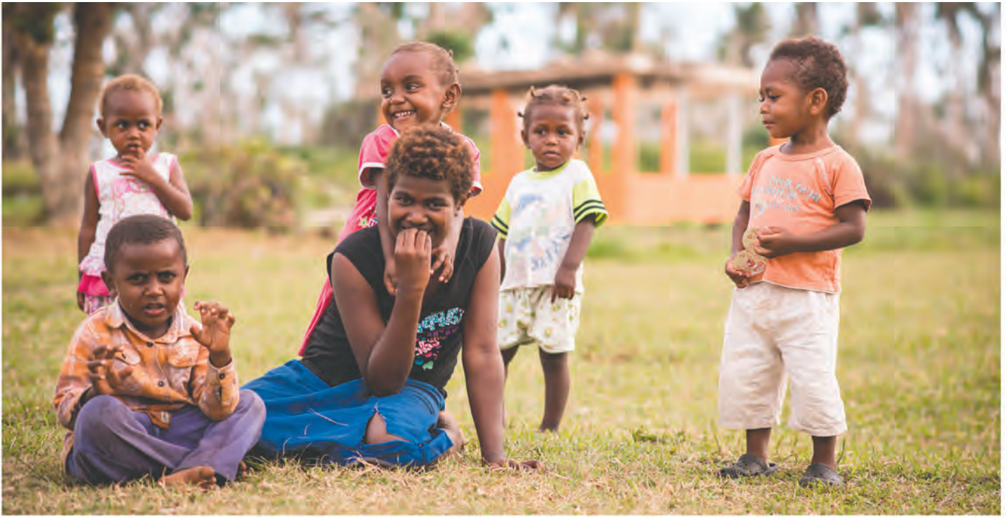
Epau, Vanuatu: A group of pikinini (children) watch Oxfam activities.