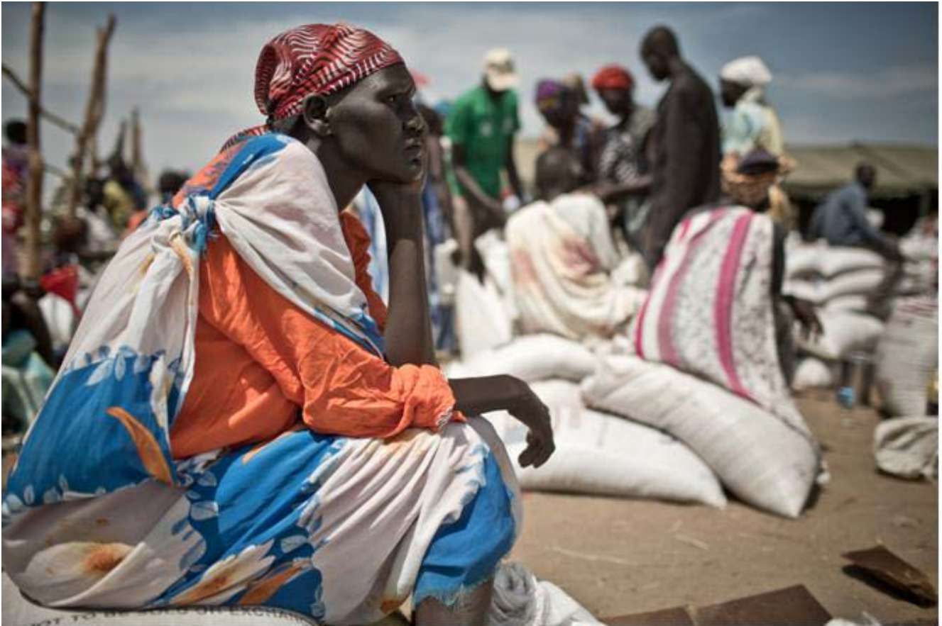
A woman waits for food in Mingkaman, Lakes state, April 2014.