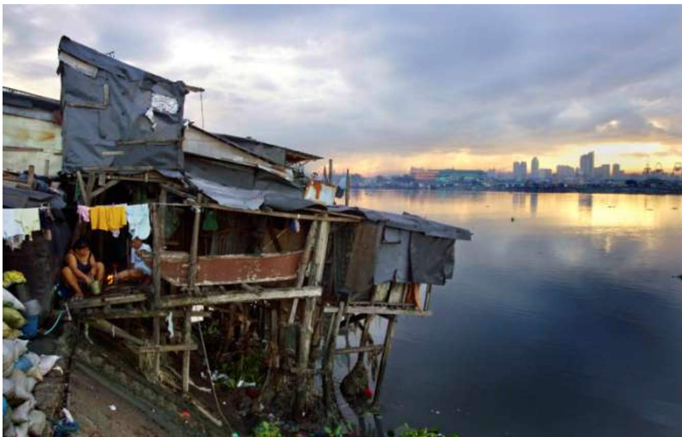
People in a waterside house raised on stilts in a slum in Manila.