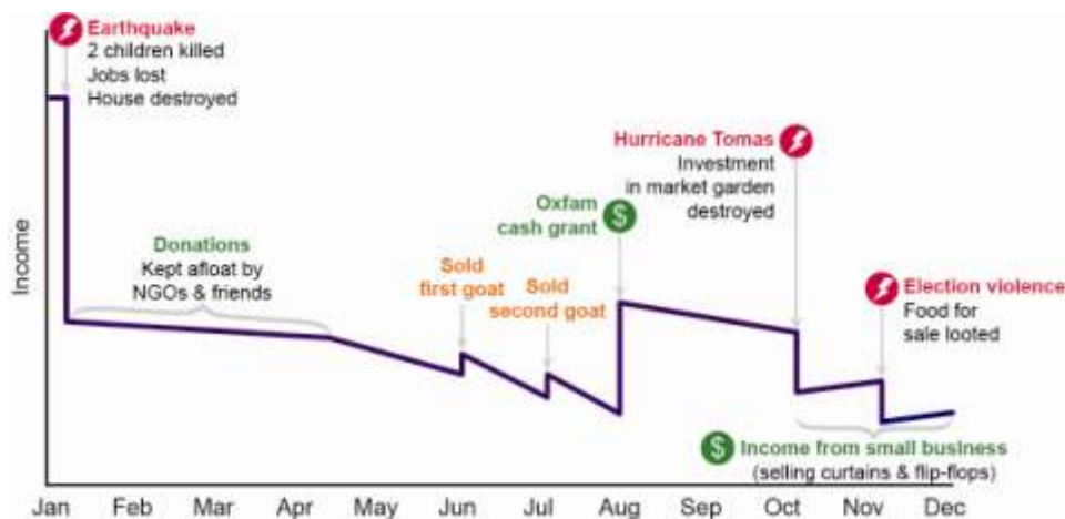
Figure 1: One family's experience after the 2010 Haiti earthquake